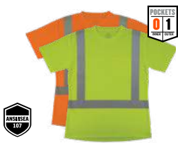
8274 Essential Hi-Vis T-Shirt - Type R, Class 2 SIZING: XS-3XL