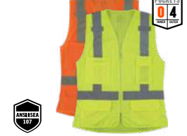
8247ZW-S Hi-Vis Surveyor Vest, Zipper - Type R, Class 2 SIZING: S-3XL

Get the full launch details at our Headquarters: ergo.zone/hvapparel