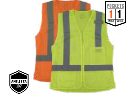
8210ZW-S Hi-Vis Vest, Zipper - Type R, Class 2 SIZING: S-3XL