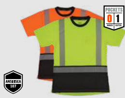
8276BK Performance Hi-Vis T-Shirt - Type R, Class 2, Black Bottom SIZING: XS-3XL