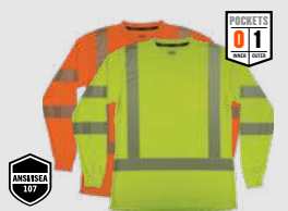
8387 Performance Hi-Vis Long Sleeve T-Shirt - Type R, Class 3 SIZING: S-3XL