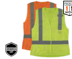
8210HLW-S Hi-Vis Vest, Hook & Loop - Type R, Class 2 SIZING: S-3XL