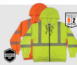
8305W Performance Hi-Vis Zip-Up Sweatshirt - Type R, Class 3 SIZING: S-3XL