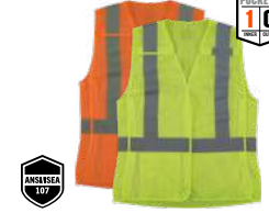
8215BAW-S Hi-Vis Breakaway Vest, Hook & Loop - Type R, Class 2 SIZING: S-3XL