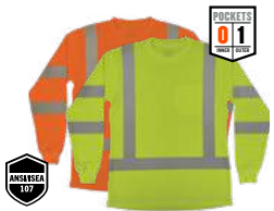
8374 Essential Hi-Vis Long Sleeve T-Shirt - Type R, Class 3 SIZING: S-3XL