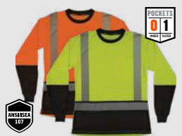
8278BK Performance Hi-Vis Long Sleeve T-Shirt - Type R, Class 2, Black Bottom SIZING: XS-3XL