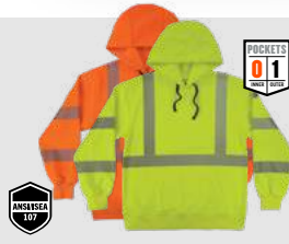
8304W Performance Hi-Vis Hooded Sweatshirt - Type R, Class 3 SIZING: S-3XL